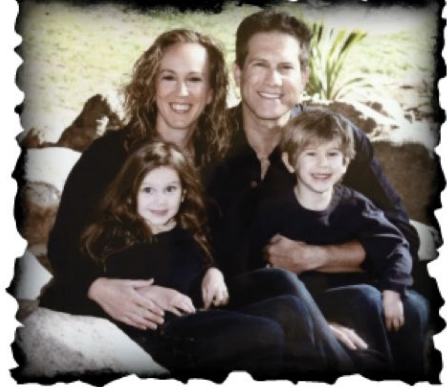
Smith Family circa 2013

incredibly inspiring documentary about elephant landmine survivors called "The Eyes of Thailand". It's the story about one woman's struggle to create the first elephant sized prosthetics for these beautiful, gentle giants.